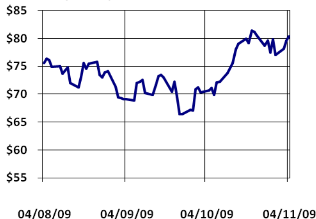
WTI (DEC09) CRUDE 3-MONTH PERFORMANCE

This morning, WTI and Brent are trading lower at $79.83 and $78.22, respectively.