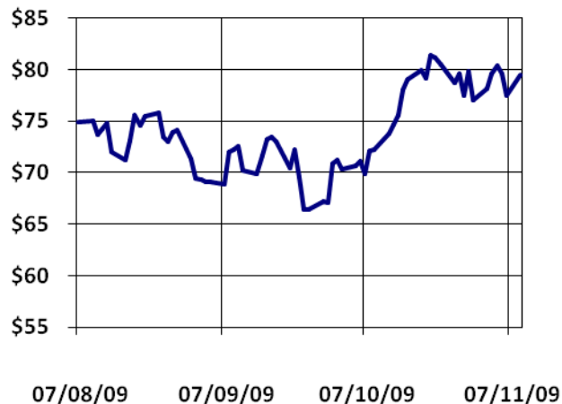
WTI (DEC09) CRUDE 3-MONTH PERFORMANCE

This morning, WTI and Brent are trading lower at $79.16 and $77.54, respectively.