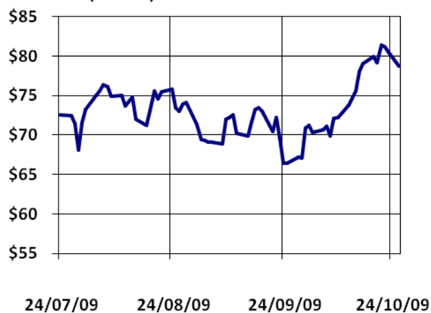
WTI (DEC09) CRUDE 3-MONTH PERFORMANCE

This morning, WTI and Brent are trading marginally lower at $78.60 and $77.21, respectively.