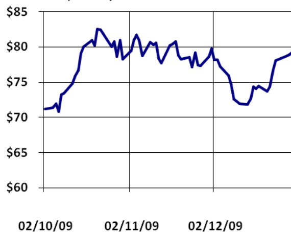
WTI (FEB10) CRUDE 3-MONTH PERFORMANCE

This morning, WTI and Brent are trading higher at $80.90 and $79.48 respectively.