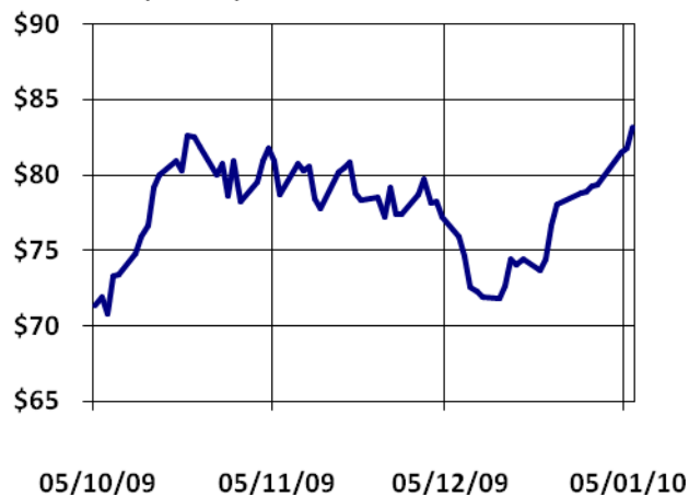
WTI (FEB10) CRUDE 3-MONTH PERFORMANCE

This morning, WTI and Brent are trading lower at $82.78 and $81.48 respectively.