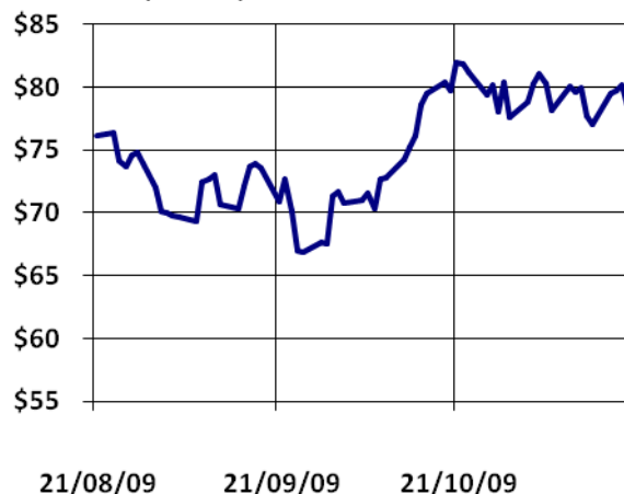
WTI (JAN10) CRUDE 3-MONTH PERFORMANCE

This morning, WTI and Brent are trading higher at $78.58 and $78.42, respectively.